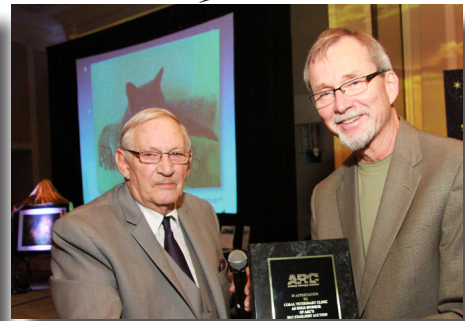
Gold Sponsor - Coral Veterinary Clinic