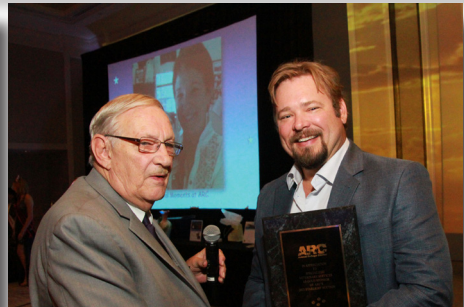
Gold Sponsor Specialized Veterinary Services