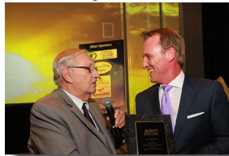
Presenting Sponsor - Arthrex