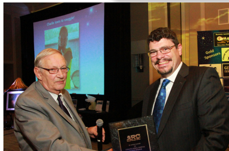
Gold Sponsor - Chiquita Animal Hospital