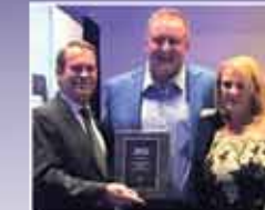
Gold Sponsor Shamrock Irish Pub