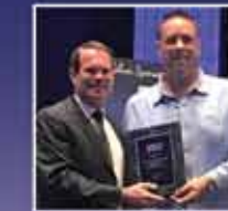
Gold Sponsor EG Contract Co.